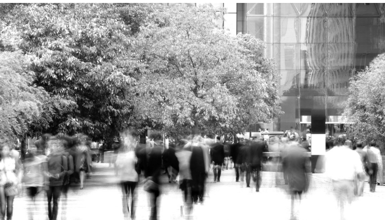
Tree ordinances are important for large cities, small towns, and developing suburban areas.

Monitoring is often the overlooked step in urban forestry. It is made easier when a tree board or department sets management goals annually and reviews the city's vision statement regularly. It also helps to stay current on what is being done in other cities with similar growth patterns and challenges. The bottom line is that ordinances are not one-time documents. They are a tool, and they need to be updated or replaced like any other tool in order to serve best.