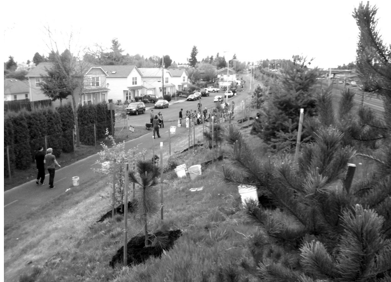
Friends of Trees organized a tree planting along a multiple-use corridor in Portland, Oregon. These trees will provide a forested buffer between the local neighborhood and the interstate, decreasing road noise and adding significant beautification to the area.

Ordinances vary in length and complexity, but the key to effectiveness is to write the ordinance simply, clearly, and tailored to the needs of your community. In the end, a tree ordinance is just another tool for proper tree care. Like any tool, it needs to be of high quality, matched properly to the job, and used with skill and care.