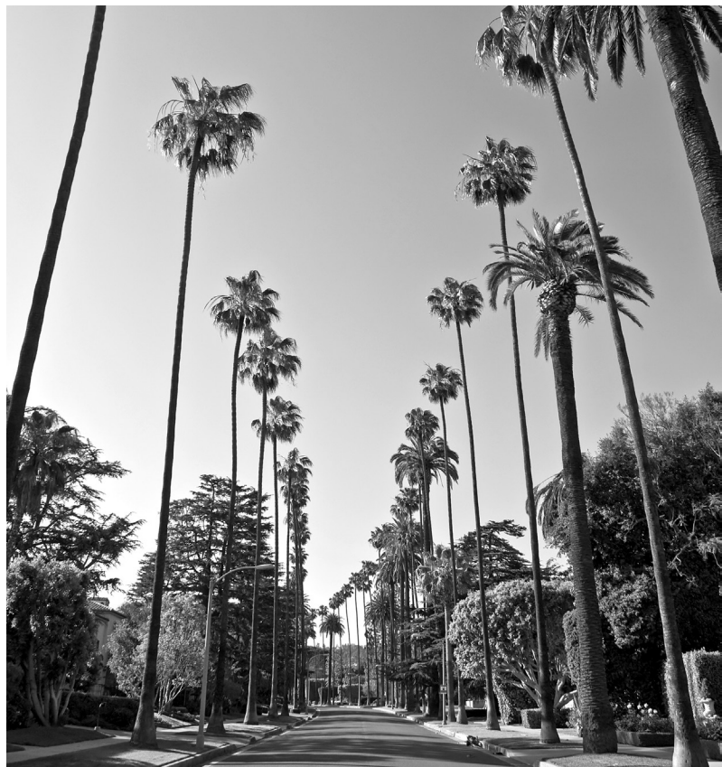
Each community's ordinance must be written to serve that community's unique needs and circumstances.

VIOLATIONS — Any person who violates any provision of this ordinance or who fails to comply with any notice issued pursuant to provision of the ordinance, upon being found guilty of violation, shall be subject to a fine not to exceed $500 for each separate offense. Each day during which any violation of the provisions of this ordinance shall occur or continue shall be a separate offense. If, as the result of the violation of any provision of this ordinance, the injury, mutilation, or death of a tree, shrub, or other plant located on city-owned property is caused, the cost of repair or replacement, or the appraised dollar value of such tree, shrub, or other plant, shall be borne by the party in violation. The value of trees and shrubs shall be determined in accordance with the latest revision of A Guide to the Professional Evaluation of Landscape Trees, Specimen Shrubs, and Evergreens , as published by the International Society of Arboriculture.