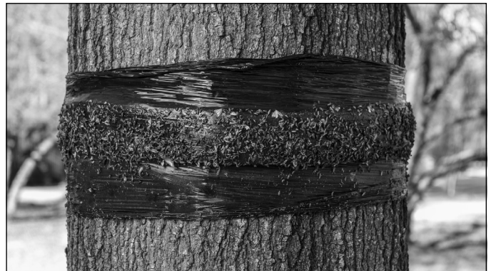
Tree banding used for cankerworms