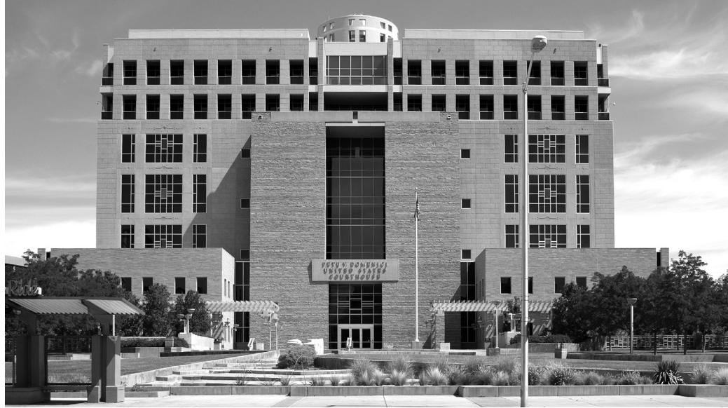
The Pete V. Domenici U.S. Courthouse Sustainable Landscape Renovation used sustainable strategies and practices to repurpose a former 4.4-acre greyfield in downtown Albuquerque, New Mexico.

The Sustainable Sites Initiative™ (SITES®) is an interdisciplinary effort by the American Society of Landscape Architects, the Lady Bird Johnson Wildflower Center at The University of Texas at Austin, and the United States Botanic Garden to create voluntary national guidelines and performance benchmarks for sustainable land design and construction and maintenance practices. A goal of this program is to enhance physical, mental, and social well-being as a result of interaction with nature. Although much of the focus is on site selection and a project's physical characteristics, there is an entire section devoted to Human Health and Well-Being. This section contains a significant part of the prerequisites for being designated a Sustainable Site.