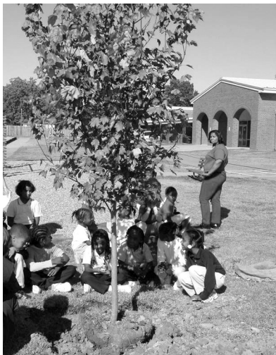
Arkansas' Washington Magnet School

incorporated math, science, history, and a variety of activities. Children not only learned more about the benefits of trees and participated in the planting — complete with a ceremony — they also became responsible for the ongoing watering and care of the trees.