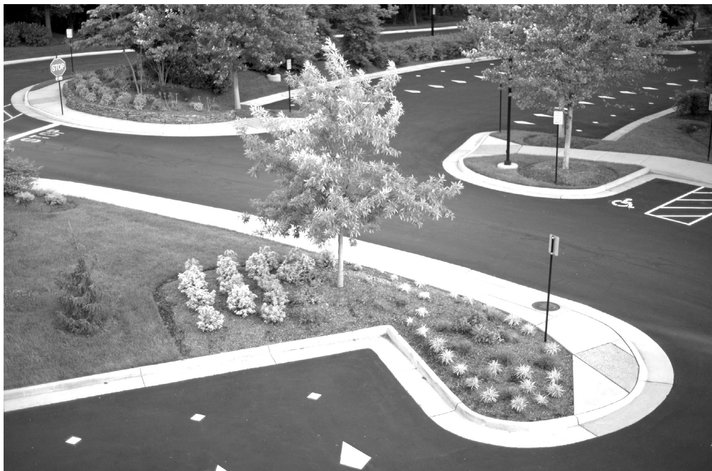
A goal of transforming red fields is job creation and a more vibrant economy, as well as additional trees and green space. Income from a partial sale after transformation can be used to endow support for green space maintenance.

—Kevin Caravati Senior Research Scientist at Georgia Tech Research Institute