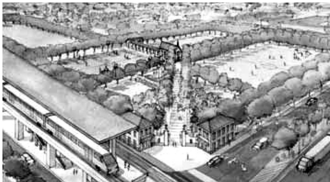
After the first phase of transformation