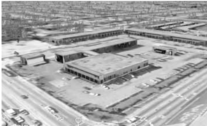
An example of existing distressed property