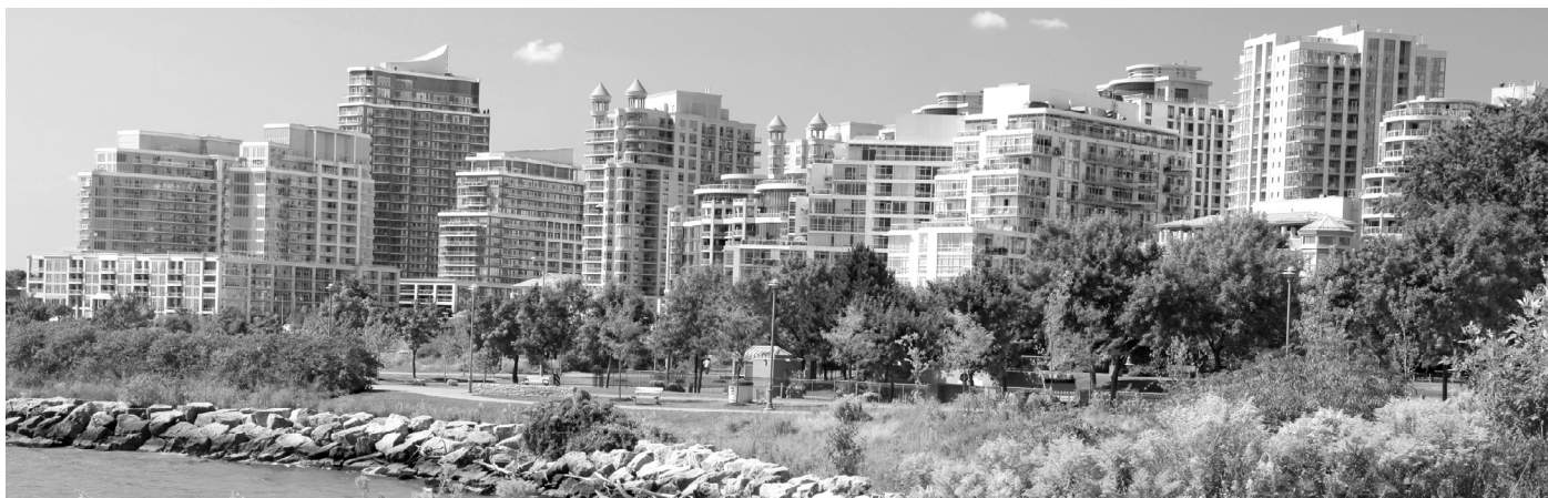
Green space and commercial development cannot only be compatible but complimentary. Red field projects can help bring these benefits to America's communities.