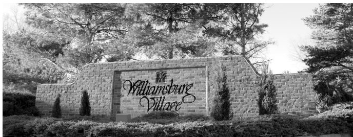
Homeowners associations are growing in popularity and have huge potential if residents and managers are made aware of the economic importance of trees and proper tree care.

The opportunity for tree boards, urban foresters, and others with an interest in trees is to help provide technical expertise and guidance. Too often, the number and kinds of trees, as well as tree health, take lower priority than general appearance, including flower beds, turf areas, and water features. The best of tree management practices should be brought to the attention of neighborhood HOA officers as well as landscaping and legal firms that are often hired to carry out management functions. If all were more aware of the economic benefits of trees, it would make a major contribution to overall urban forestry. For examples of two educational efforts being directed toward HOAs, be sure to visit arborday.org/bulletins .