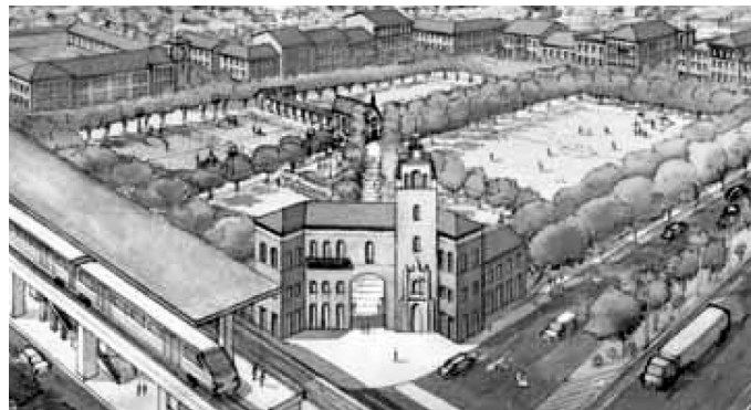
In the final phase of a red fields project, a portion of the property is sold for mixed-use development.