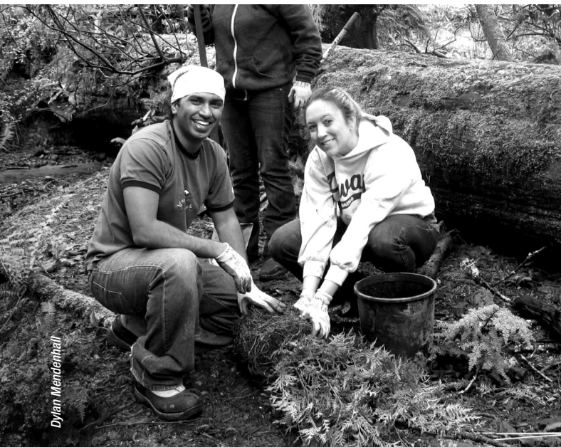
‘Green Redmond’ was a project near Seattle to restore and maintain city parks and natural areas. Rather than waiting for volunteers to step forward, Forterra actively recruited young people in area schools and youth groups. One of several reasons was for the youth to be ambassadors, carrying environmental information to the older generation.

Another notable effort to groom future leaders is the Arbor Day Foundation’s partnership with Alpha Kappa Alpha, the nation’s oldest Greek-lettered organization established by African-American college-educated women. Under this agreement, tree-planting events are held at Historically Black Colleges and Universities that qualify for the Tree Campus USA Award. Among the criteria for this award is a requirement for a campus tree advisory committee, and at least one member must be a student. Students are also expected to be involved in planning for tree care, conducting an Arbor Day observance, and taking part in a service learning project. To promote the Tree Campus USA program at the nation’s 101 Historically Black Colleges and Universities, the partnership provides internships to 9 students each year to spearhead recruiting efforts and help implement the program.