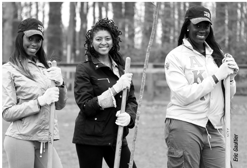
Hands-on leadership skills are developed through training and ‘real world’ participation that are built into a partnership between Arbor Day Foundation and Alpha Kappa Alpha.