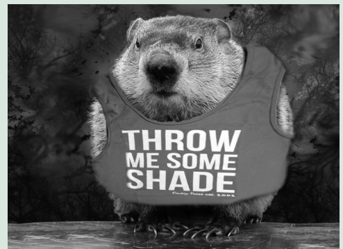
Catchy items for sale, like this tank top, help raise funds and provide opportunities to deliver the organization's message.

Taken together, these methods of communication catch attention and provide an opportunity for people to contribute and/or share the information through their own digital channels. Fundraising also provides the ability to display and sell branded merchandise that helps show the benefits of Casey's tree-planting programs.