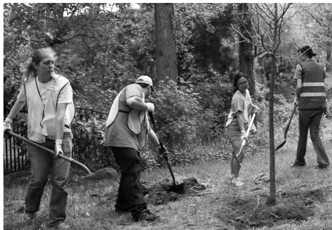
Social marketing is another valuable way to help ensure trees and stewardship for the future.

For links to organizations featured in this issue and other related information, please visit arborday.org/bulletins and click on "Supplemental Resources Library."