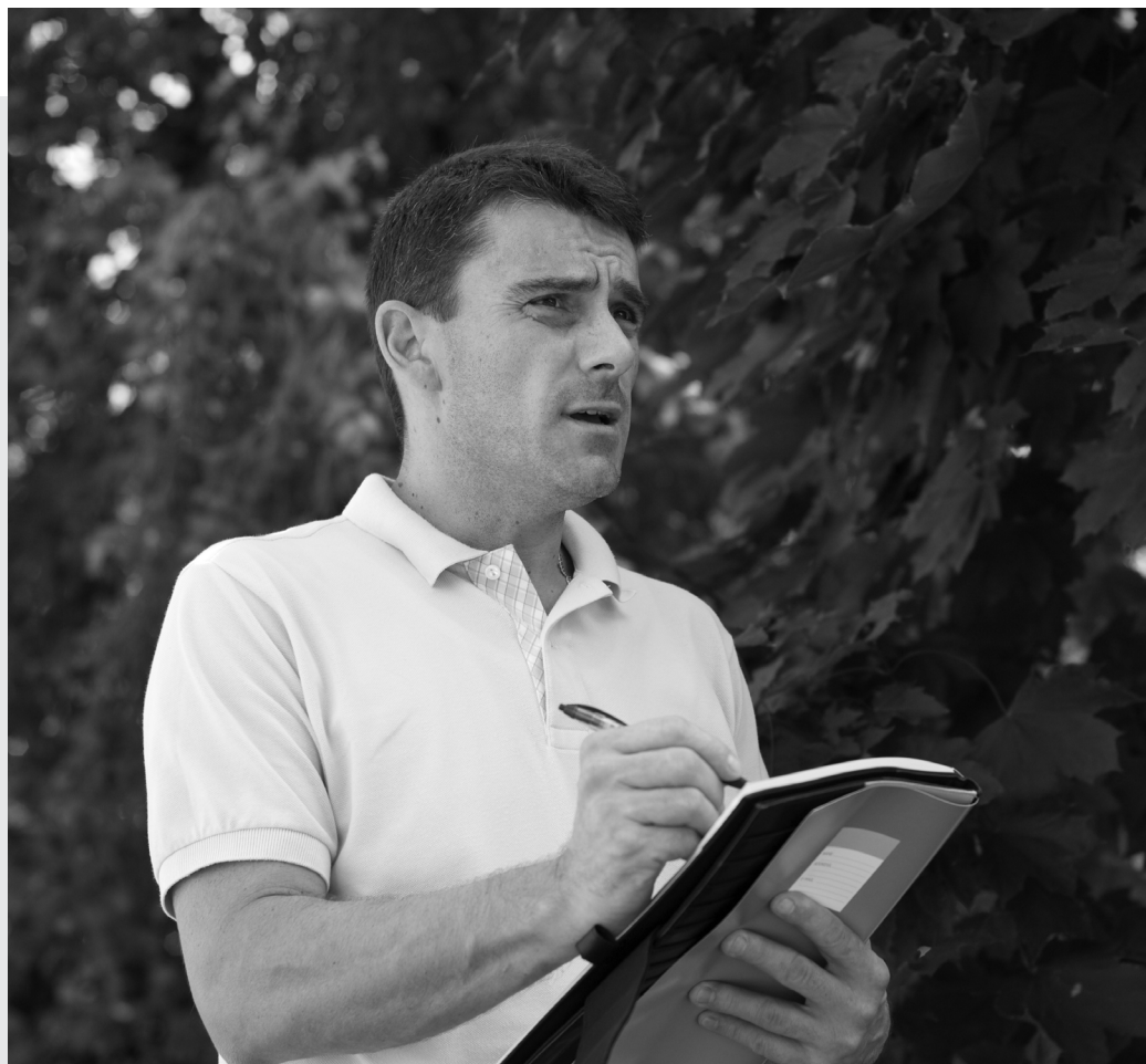
Planting trees is important, but monitoring and evaluation is essential to ensuring long-term success.

By using some of the tools presented in the pages of this bulletin, it is possible to more clearly see where we are and to plan for what is needed in the future. In short, they can strengthen community forestry in a number of ways. They allow tree boards and forestry staff to quantify progress — or lack of it. Proven progress can be communicated to those who support — or should support — the idea of community trees. Everyone likes success, and it is human nature to rally around a successful cause. On the other hand, by understanding lack of progress, those responsible for urban forestry can plan interventions to correct a situation and turn it into success.