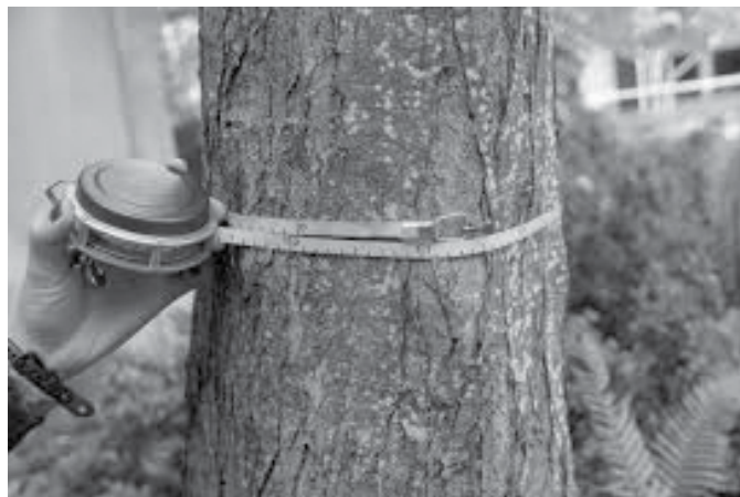
Unlike in a one-time street tree inventory, measurements of diameter, height, and other tree characteristics must be taken with precision in order to monitor change over time.

Join online at urbantreegrowth.org/join .