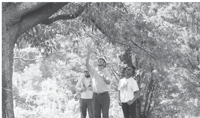
Casey Trees volunteers in Washington, D.C., serve to monitor the city’s trees as part of preparation for the city’s annual Tree Report Card.

Each year, four evaluation categories, called metrics, are given numerical scores and grades. These are averaged for the final grade.