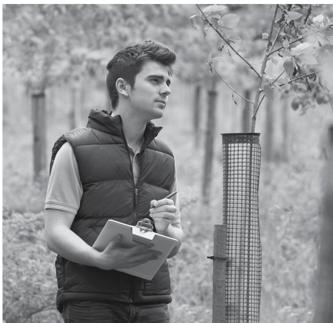
Urban Tree Monitoring: Field Guide is written in a way that volunteers can consistently and accurately gather information for a minimum data set. Guidelines for more advanced tree health monitoring are also provided but are intended primarily for professionals.