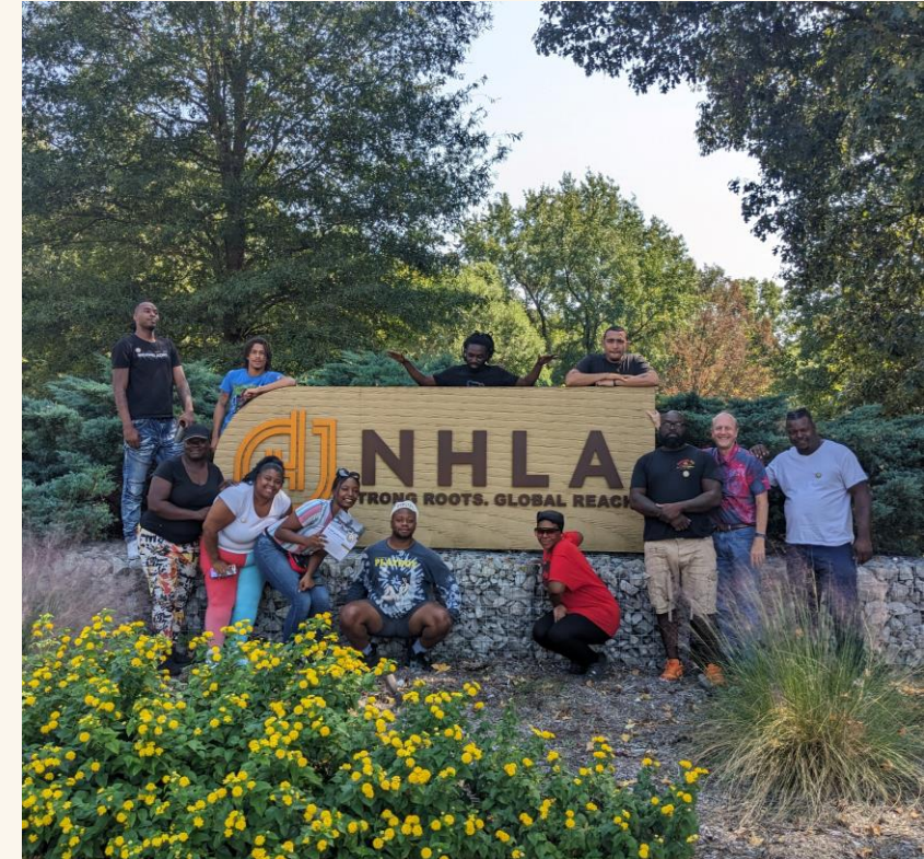
Partnerships & Wrap-around services