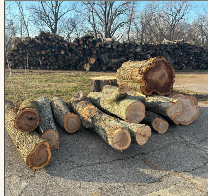
Memphis Urban Wood, a near-zero-waste urban wood reuse facility creating jobs and merchantable wood products