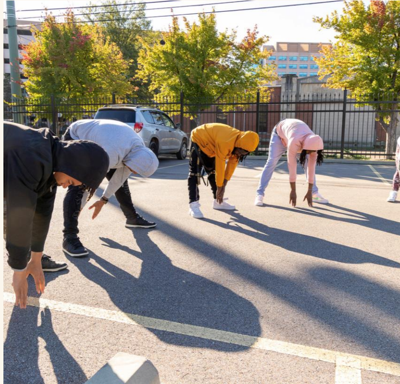
Fostering routine both on and off the clock