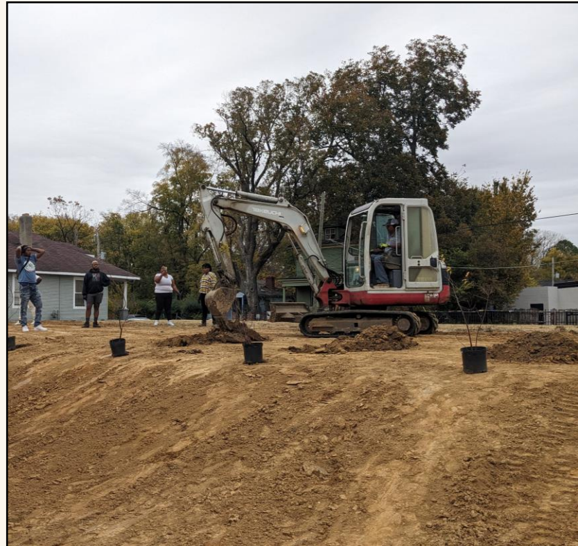
Regenerative landscape design practices on various properties owned by TWI, incorporating native trees and plants