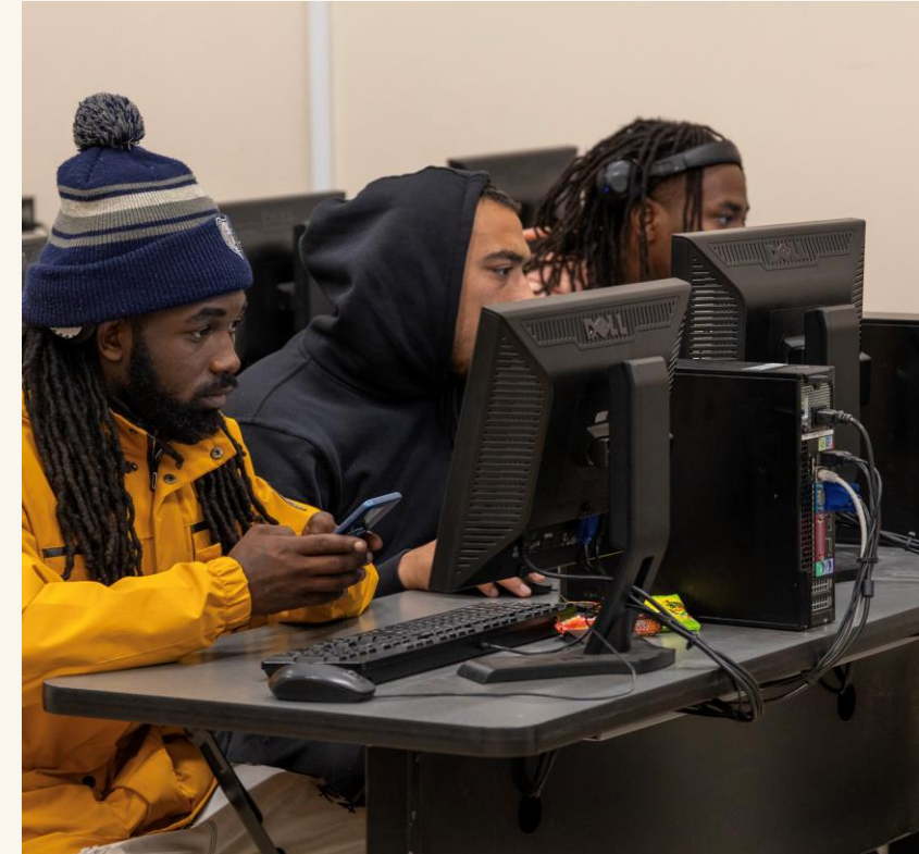
Removing barriers and creating new pathways