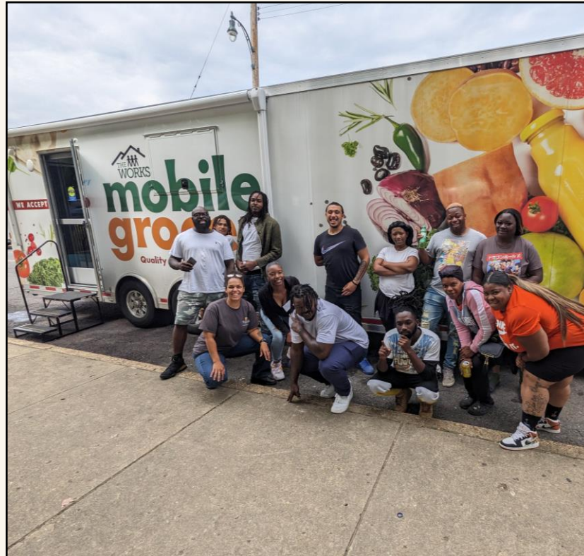
Mobile grocer that travels to various neighborhoods fighting food access inequities