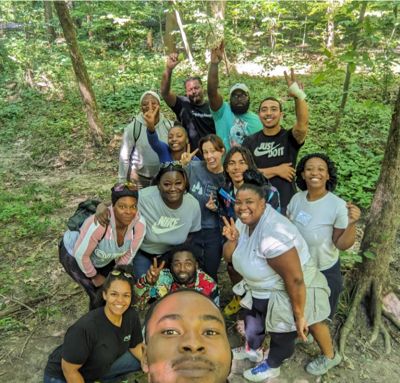
Making space in natural places