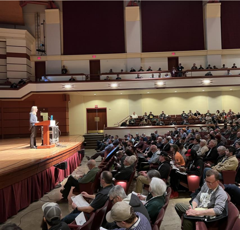
Working with professionals