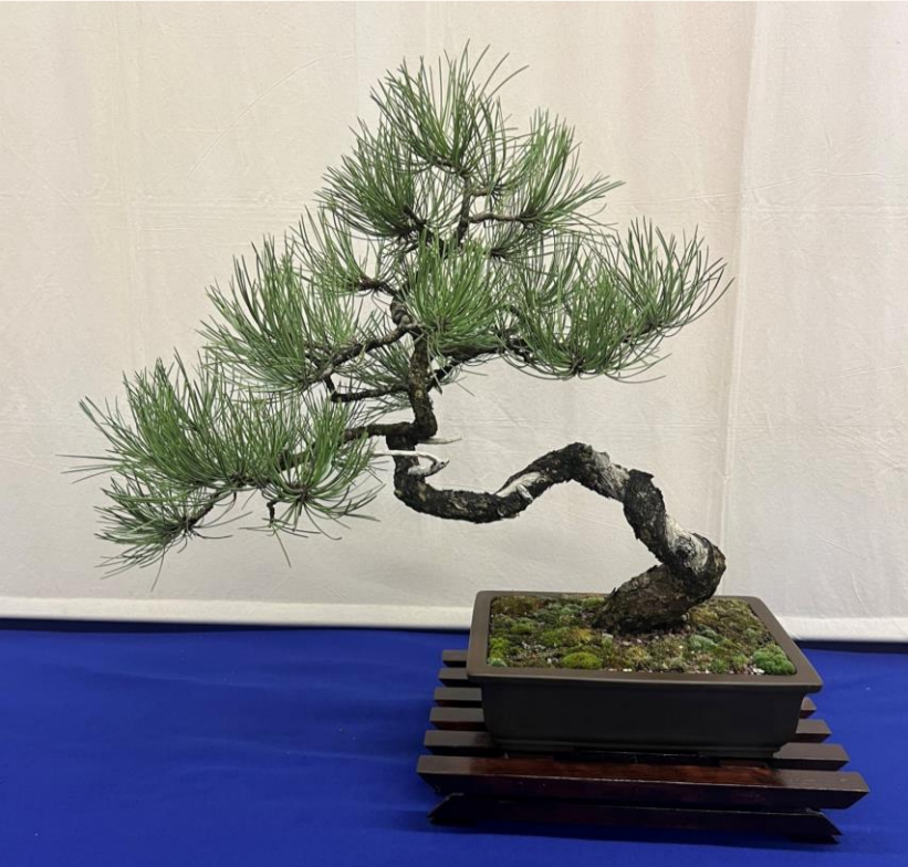
Defining your purpose