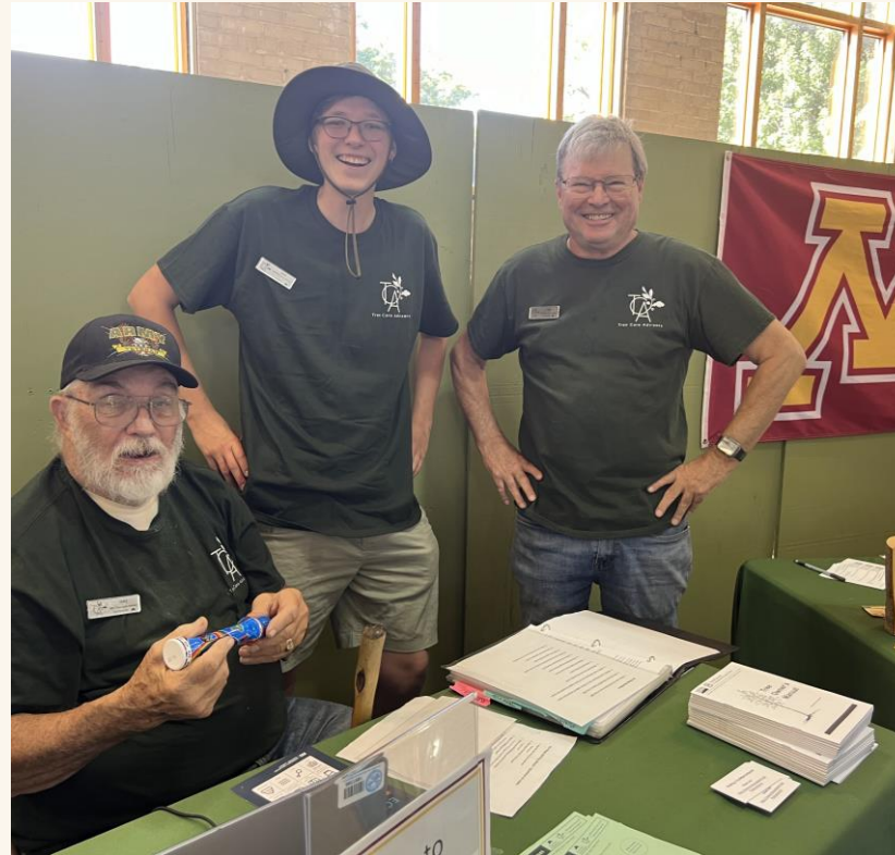
Coming together at the Minnesota State Fair