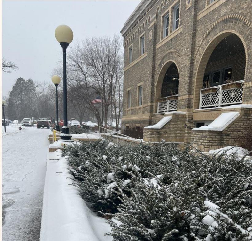
Lights, camera, action!