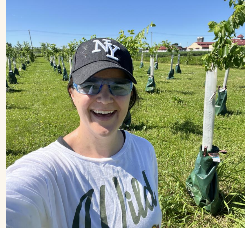
Watering your own tree