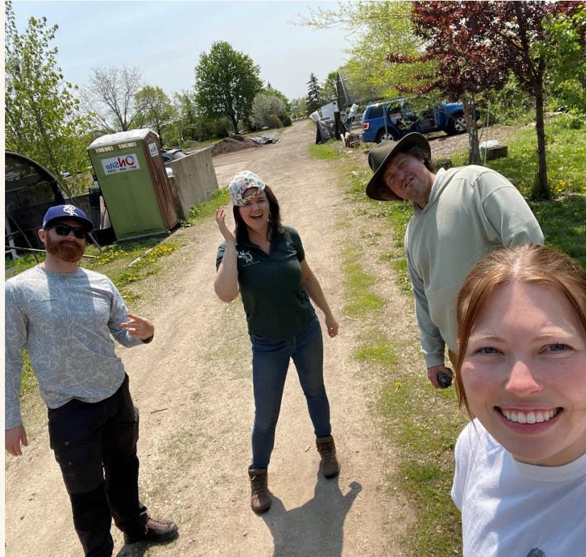
You are not alone