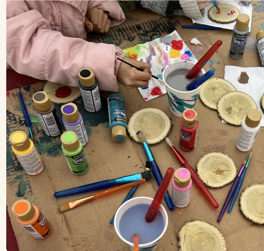
Painting tree cookies at a community event