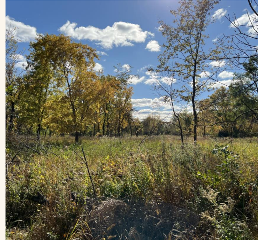
Planning in tree time