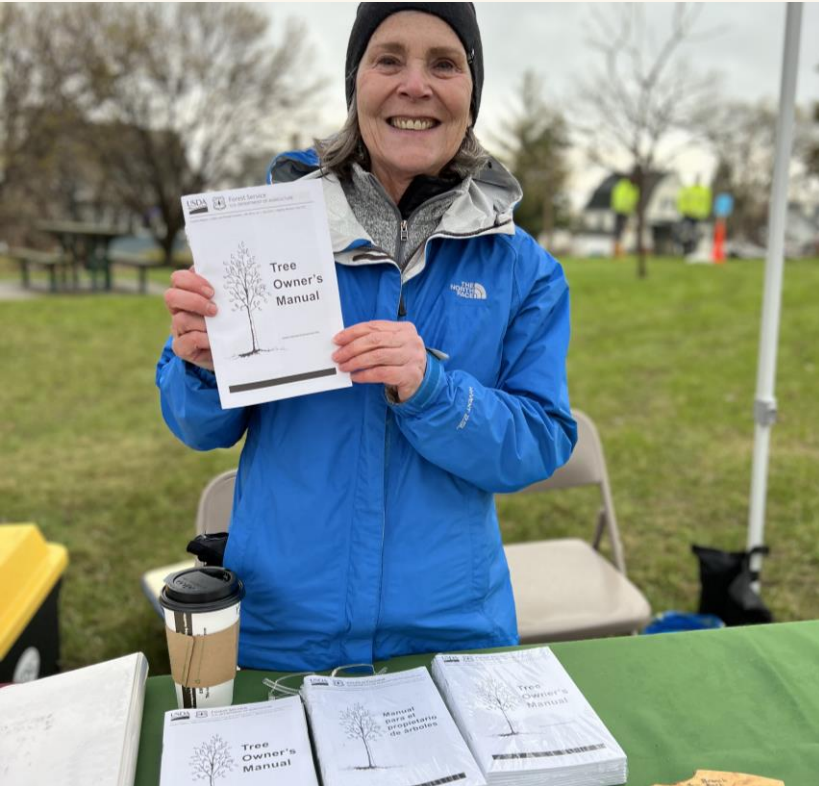
Sharing research-based information