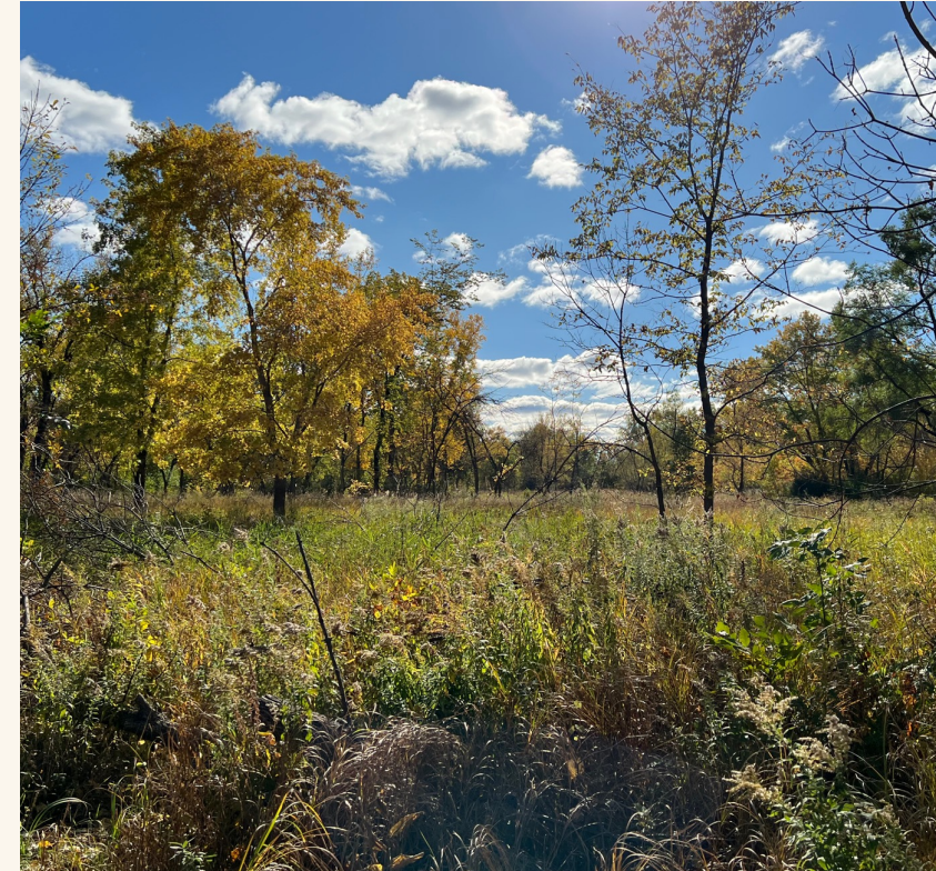
Planning in tree time