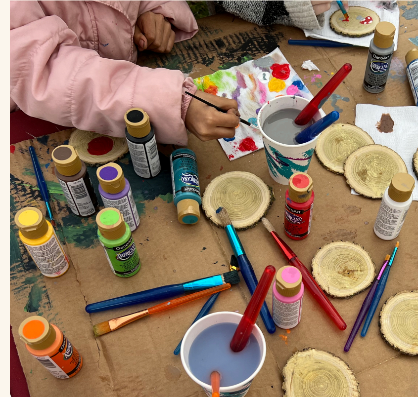
Painting tree cookies at a community event