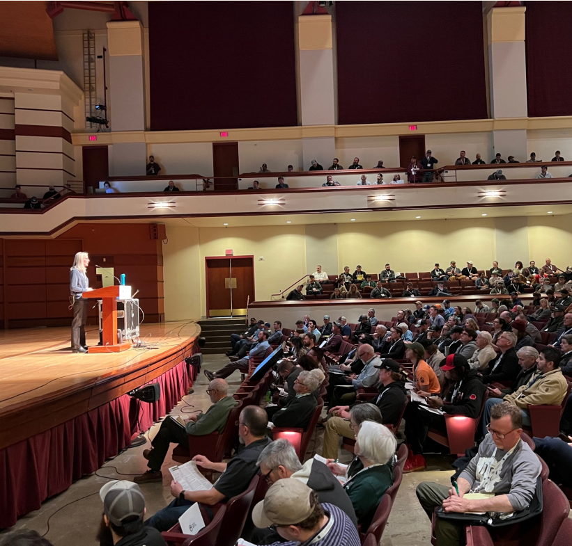
Working with professionals