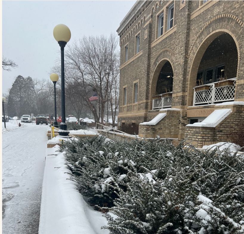
Lights, camera, action!